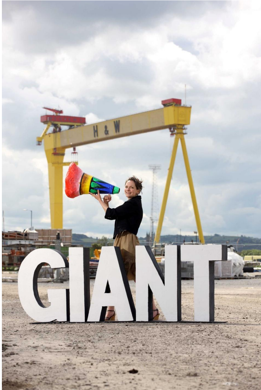
Land of Giants